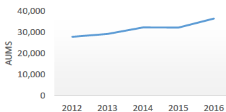
Figure 3. BLM AUMs Billed, 2012-2016